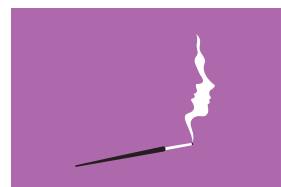
Private Lives 24th–28th October (p7)