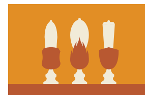
The Last Quiz Night on Earth 12th–17th February (p17)