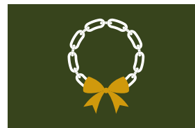
A Christmas Carol 21st–25th November (p11)