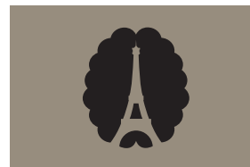
The Father 11th–16th September (p3)