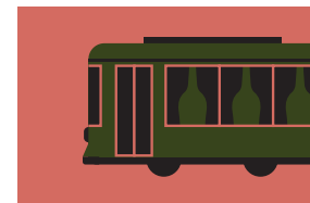
A Streetcar Named Desire 3rd–7th October (p5)